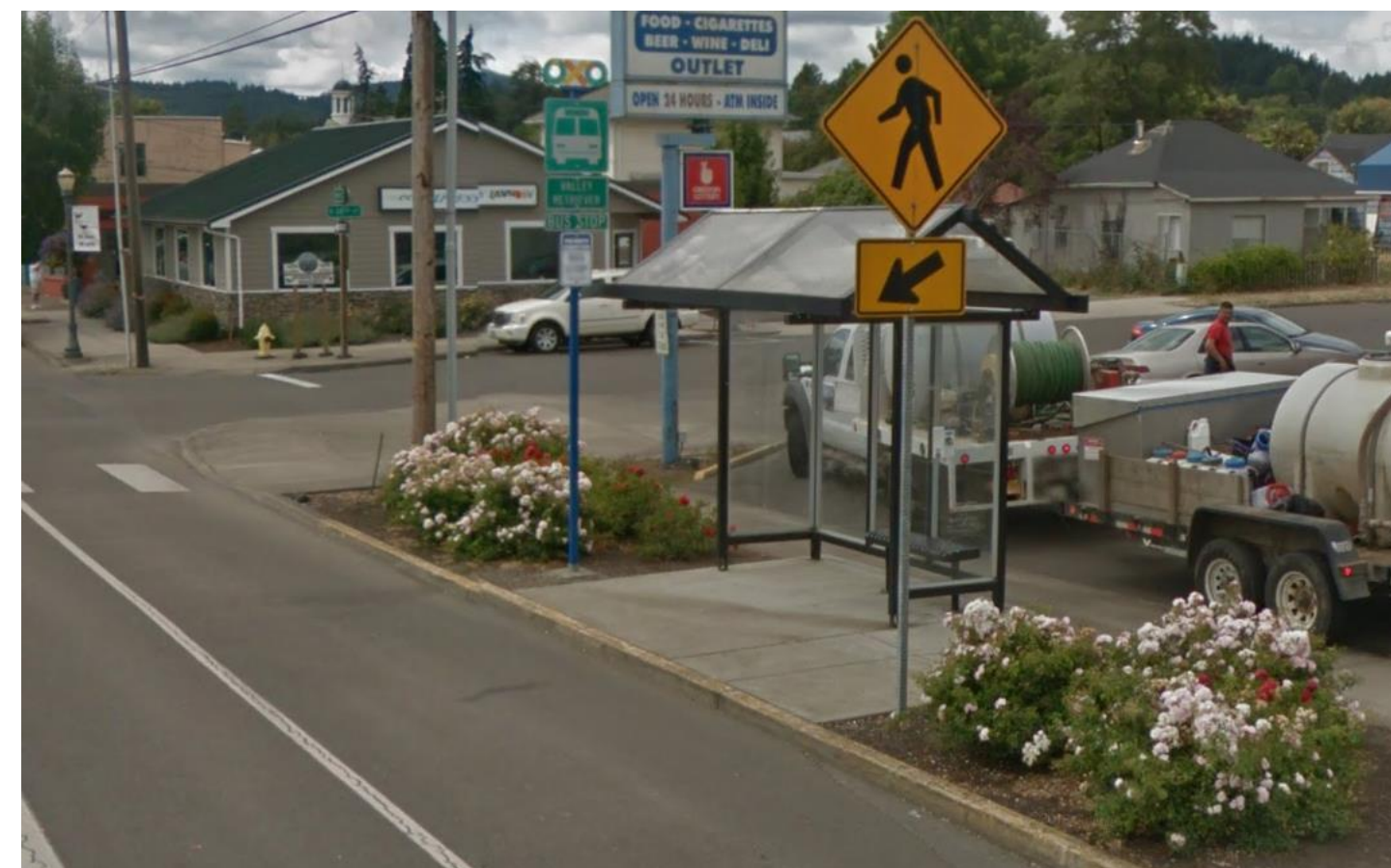
Philomath Connection bus and bus stop with shelter at Main St / N. 14<sup>th</sup> St.